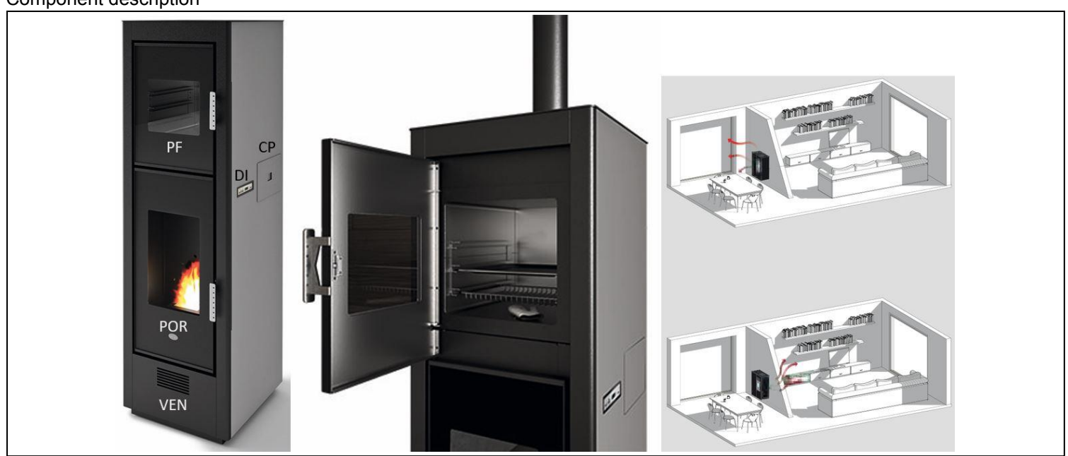
Key: VEN: ventilation air outlet; CP: extractable pellet drawer; DI: display; POR: firebox door; PF: oven door.